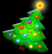
Foundation 1 and 2 perform Prickly Hay